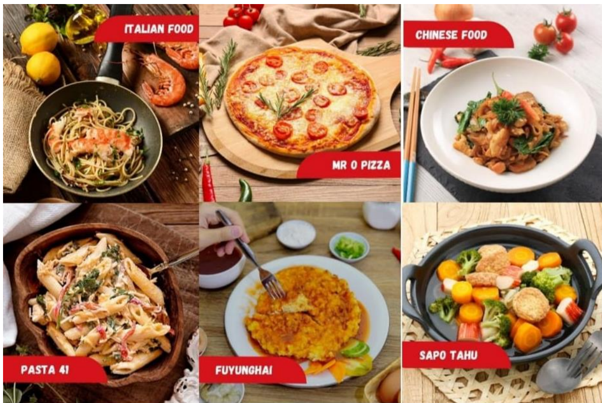
Figure 2. Menu Offered by Bisa Kitchen

Improving the outlet visuals can attract consumers and improve the brand image of Bisa Kitchen. This can increase brand awareness, differentiating Bisa Kitchen from its competitors by designing a brand awareness strategy. Attractive and comfortable interior design can create a captivating engagement for customers. Make sure the outlet has the perfect layout, proper lighting, and finishing touches that reflect the character of the Bisa Kitchen brand. By prioritizing outlet centers that can attract customers and improve Bisa Kitchen's brand image, brand mindfulness can be expanded, which can further differentiate Bisa Kitchen from its competitors.